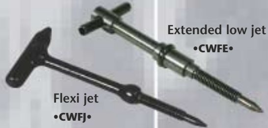
Flexi jet •CWFJ•