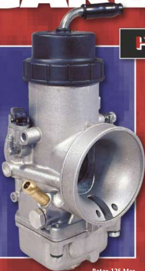
Rotax 125 Max Carburettor •ERWCA10•

The Rotax 125 Max is now a worldwide phenomenon. The engine and all its components are designed for ease of use, and this includes its Dellorto carburettor. The slide carburettor is easy to adjust and set up, allowing every driver to concentrate on racing whilst on the track.