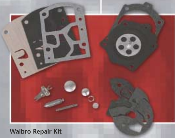
Walbro Repair Kit •CWDRK•

Numbered parts (in exploded diagrams only) are for easy cross referencing with DPE Price List. Consult Price List for complete listing of product codes, sizes etc.