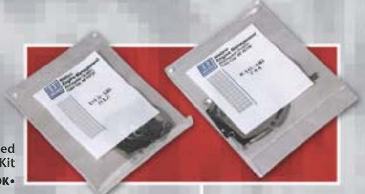
Walbro Piston Port Diaphragm Kit •CWDKPP•