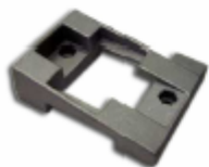
30mm 20BS30EC 32MM 20BS32EC