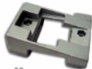
30mm 30PEC30 32MM 30PEC32