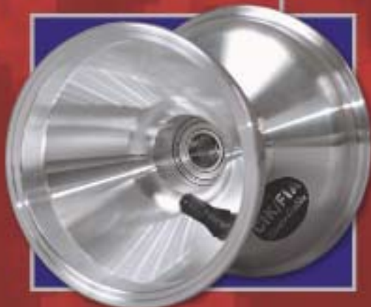
Wheel – front

Edwards Wheels are known all around the world. Their name is synonymous with high quality and affordable prices.