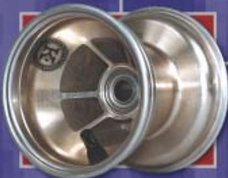
Wheel – front magnesium