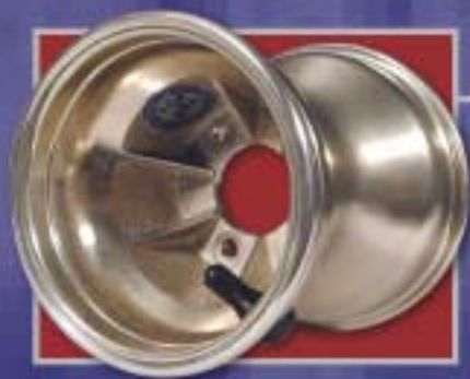
Wheel – front magnesium (for use with front hubs)