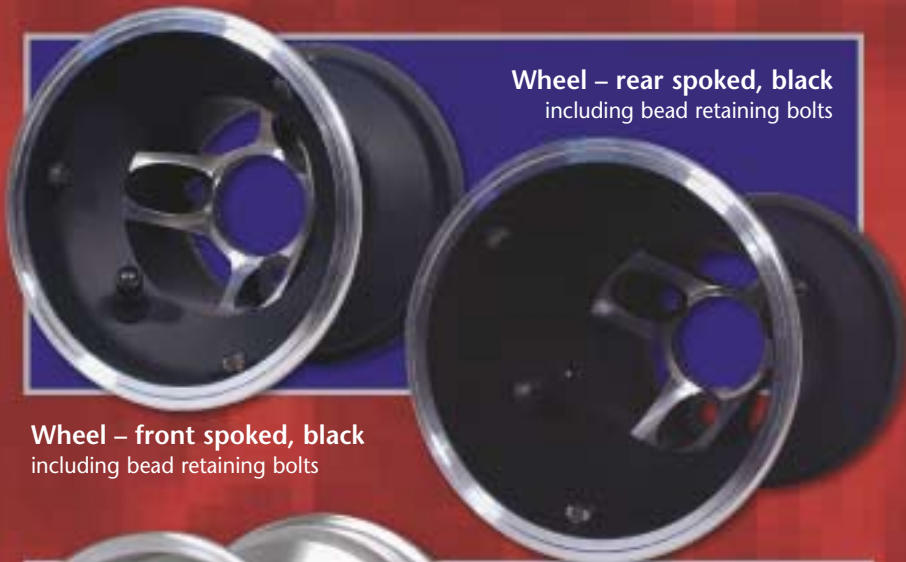
Wheel – rear spoked, black including bead retaining bolts