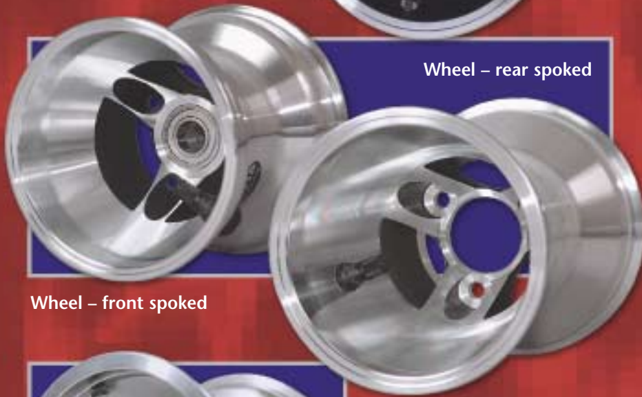
Wheel – rear spoked