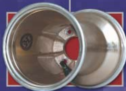
Wheel – rear magnesium

DPE now offer a range of magnesium wheels. These wheels are realistically priced and are quickly gaining popularity, particularly with the performance orientated karter.