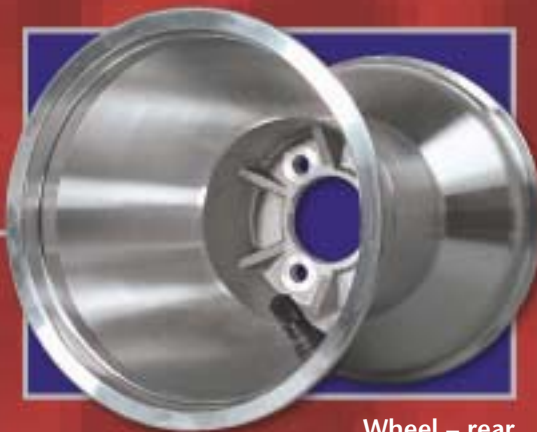
Wheel – rear